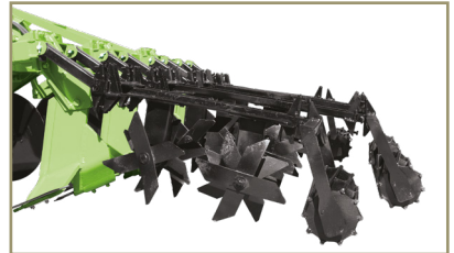
Spike tooth harrow and leveler roll.